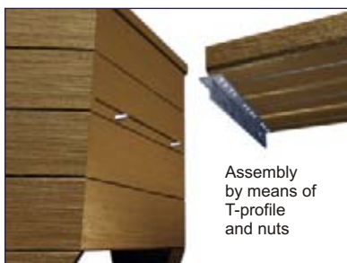
Assembly by means of T-profile and nuts